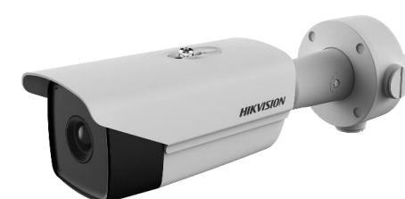
Thermal Camera DS-2TD2137/VP